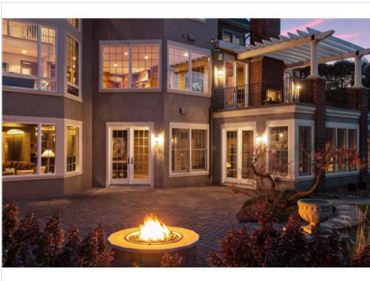
Huge paver back patio with gas firepit