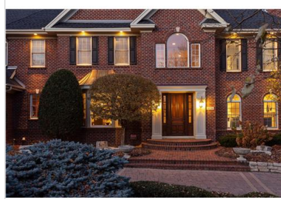
Elegant brick paver driveway and entryway