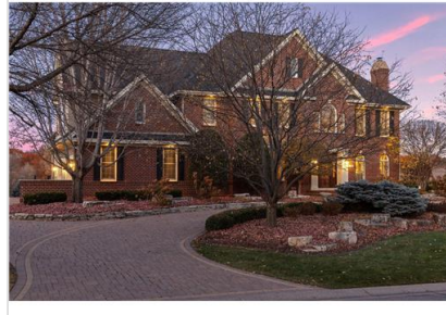
Classic Charles Cudd designed home