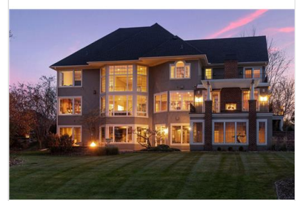
Melrose Chase features some of Bearpath's most desirable lots/settings!