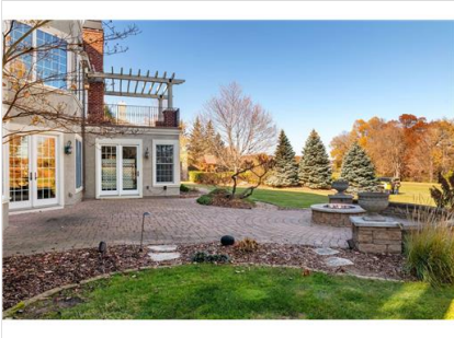
Another great angle...