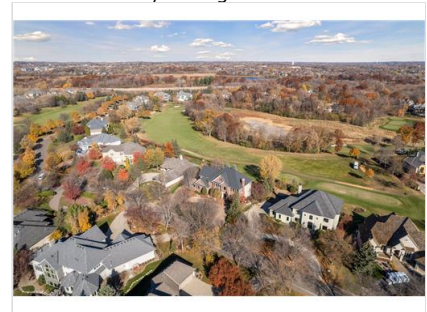
Panoramic views of the 14th hole and so much more beauty...