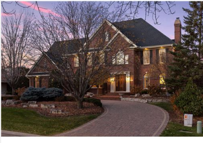
Welcome to 18756 Melrose Chase