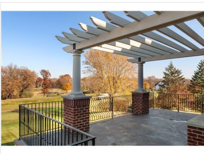
Distinctive pergola adds class to the large concrete deck